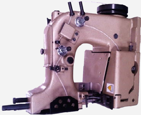
MODEL GK35-6C MACHINE HEAD

KEESTAR offers the latest technology in bag closing height adjustable pedestal and advanced bag closing machine head.