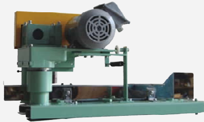
MODEL CP4900 FEED-IN DEVICE