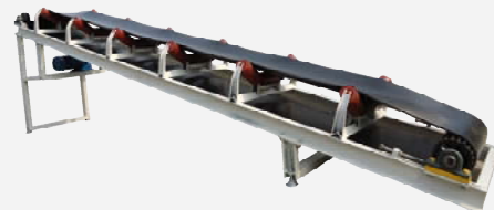
MODEL GK-SX CONVEYOR