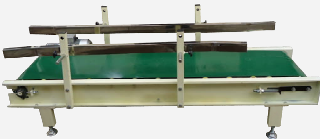
MODEL GK-SB CONVEYOR